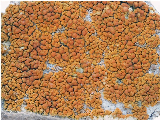
Fig. 2. Thallus of Calogaya saxicola (TUF068062) with short marginal lobes and crowded apothecia, but lacking pruina.

CLADONIA DIVERSA Asperges ex S. Stenroos – NW: Harju Co., Tallinn, Aegna Island, group of erratic boulders within dry pine forest (59.58217°N, 24.77271°E), over the layer of bryophytes and humus on erratic boulder, leg. I. Jüriado & A. Meltsov 1 July 2021, det. I. Jüriado & A. Suija 4 Oct 2021 (TUF091699; UDB0818904). Freq.: rr.